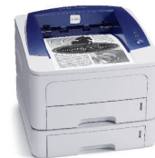
Phaser 3250 shown with optional Tray 2